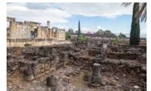
Roman ruins at Capernaum. Capernaum was a fishing village on the northern shore of the Sea of Galilee.

The synagogue was a place of prayer and instruction: the Temple was the place of sacrifice.