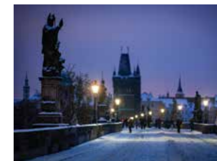
The statue of Augustine of Hippo on the Charles Bridge in Prague

A mystery is a truth of our faith that we can explore, but never fully understand.